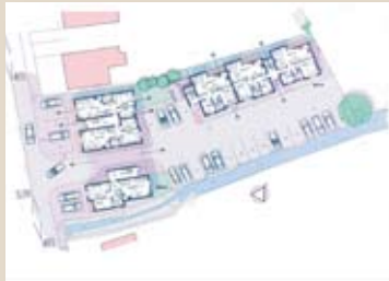
CAD and Technical Drawings

Offering 600dpi high definition (HD) optical resolution, superior color CCD technology and the cost / performance benefits of instant-on LED illumination, these scanners provide crisp, sharp fine line detail found in technical documents and maps with accurate color reproduction of artwork, photographs and graphics originals.