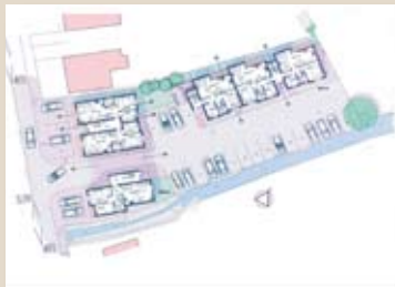
CAD and Technical Drawings

Offering 600dpi high definition (HD) optical resolution, superior color CCD technology and the cost / performance benefits of instant-on LED illumination, these scanners provide crisp, sharp fine line detail found in technical documents and maps with accurate color reproduction of artwork, photographs and graphics originals.